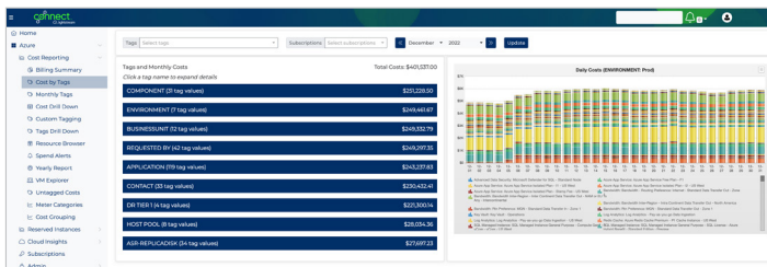
Click an image to view larger